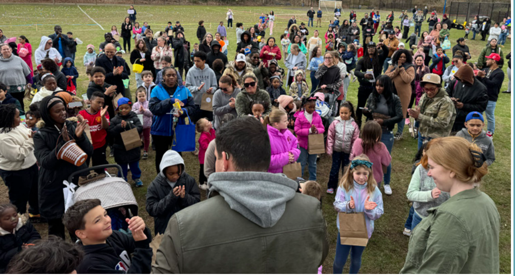
Walnut Hill's Operating Fund supports our vision of Igniting a Passion for Jesus in Connecticut, New England and Around the World.

Thank you for your generous and faithful giving!